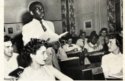
Segregation in public schools becomes unconstitutional